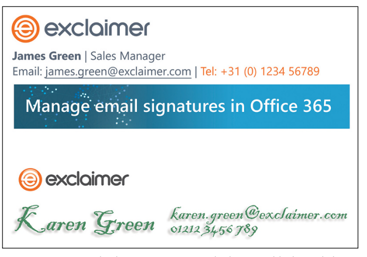
FIGURE 3-1: Separately, these signatures may look acceptable, but side by side the inconsistency looks unprofessional.

The bottom line in all this is that professionalism counts – and inconsistent email signatures are unprofessional. (See the examples we give in Figure 3–1.)