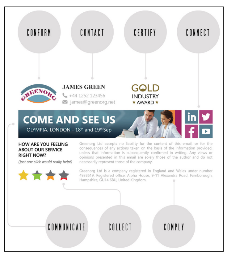
FIGURE 1-1: The 7Cs framework.

In the following seven chapters we highlight the important elements of each component in the 7Cs framework and, where possible, illustrate its use based upon real-world customer experience. We discuss each part of the framework at length, examining closely how signatures perform functions, considerations to keep in mind when applying the learning yourself, and key takeaway concepts for continued and advanced use.