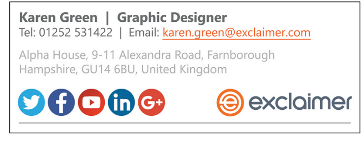
FIGURE 5-1: Integrate social media links in your email signatures.

Take a look at Figure 5-1 to see how interactive buttons and links can integrate social media with an email signature.