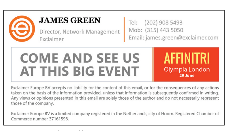
FIGURE 6-1: A simple email banner.

Figure 6–1 gives an example of a more subtle banner. Sedate, simple, minimal – the design suits the email signature channel far more than a banner ad visual. An ad on a web page has to compete for attention against the native, first-party content and the other third-party ads. That busier context requires a much bolder visual than the plain black text on a white background of an email – so adjust your image accordingly.