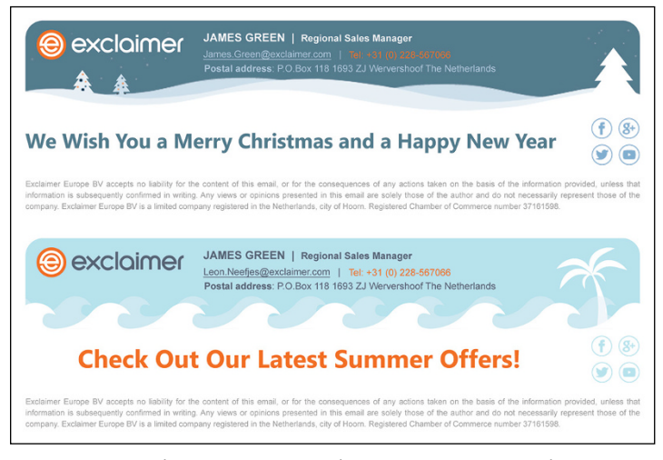
FIGURE 6-2: Using banner variations to keep content current and interesting.

Figure 6-2 shows an example of how a banner may change to reflect recent news items.