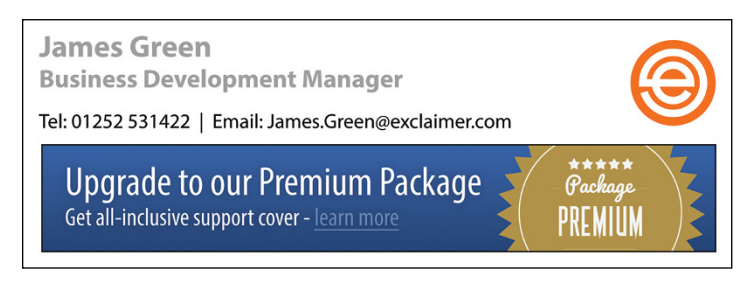
FIGURE 6-3: Example of promotion in a banner.

Figure 6–3 shows how the banner can propose a product or package cross–sell without forcing the sales agent to work it into a conversation.