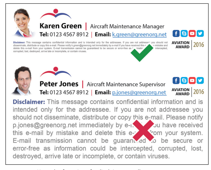
FIGURE 8-1: Keep the font size of a disclaimer small.

When you're replying, put the signature just below your own message but the disclaimer at the very bottom of the email chain. It's still on the email, but it's away, where the reader won't be annoyed by it.