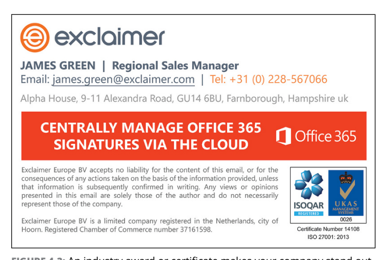
FIGURE 4-3: An industry award or certificate makes your company stand out.

Organizational qualifications apply to the whole company. Examples might include being a Microsoft Partner organization or meeting a quality standard such as ISO 9002. Displaying these qualifications on everyone's emails is a good idea because they reflect well on the whole organization and will be understood as useful and authoritative by any recipient. See Figure 4-3 for an example.